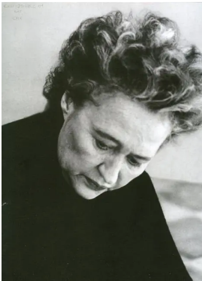
Chryssa Contemporary Greek Art Institute